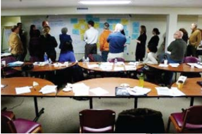
Kick-off meeting at the Resource Center for Independent Living for the Utica/Oneida Food Policy Council